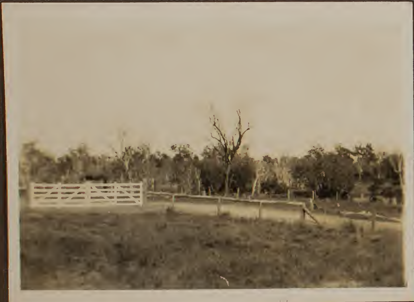
From Train Queensland Railway showing my hotel house 13. vii 28